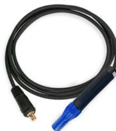
71.24.001 Stick electrode holder