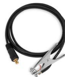
71.25.001 Work cable