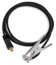
71.24.001 Stick electrode holder